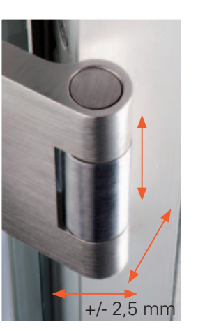
horizontal and gasket pressure +/- 2,5 mm