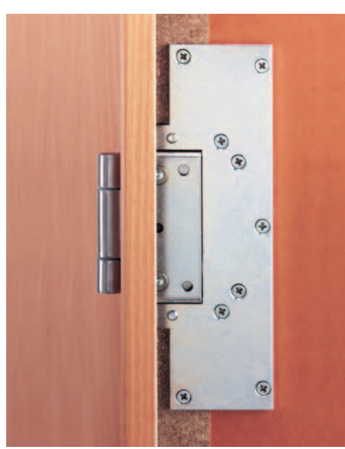
Hinge Just 3D for solid timber and cover frames